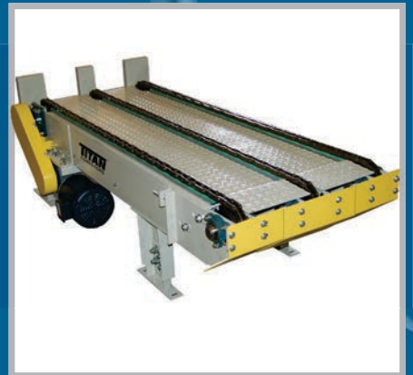
Multi-Strand Chain Conveyor