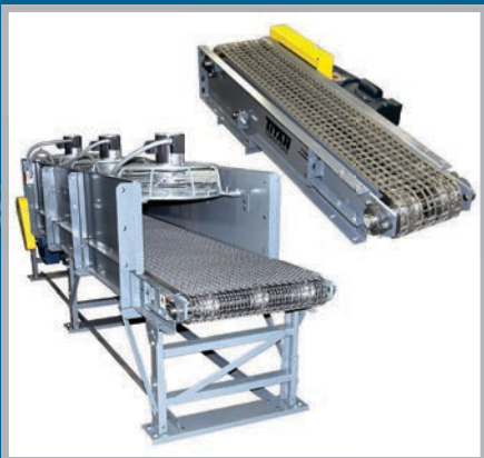
Wire Mesh Conveyors