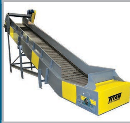
4", 6" Pitch Hinged Steel Belt