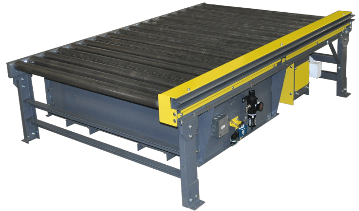
Special 526 with 3 strand chain transfer

Titans' Model 526 is designed for handling pallets, skids, drums. The unit incorporates a number 50 chain with a roll-to-roll drive, with #60 chain optional for heavier loads. The frame is heavy formed 7 gauge construction with a one piece chain guard. Rollers are 2-5/8" diameter x 7 gauge ( 580 lb. capacity ). The standard drive is a 3/4 H.P. with 30 F.P.M. roller speed. A wide range of standard effective widths are available. Standard roller spacing is 5", with 2-13/16", 3-19/32", 4-3/8", and 5-15/16" centers available with #50 chain. Floor supports are optional. The Model 526 comes in lengths to suit with a minimum length of 4' long. Consult the factory for further details.