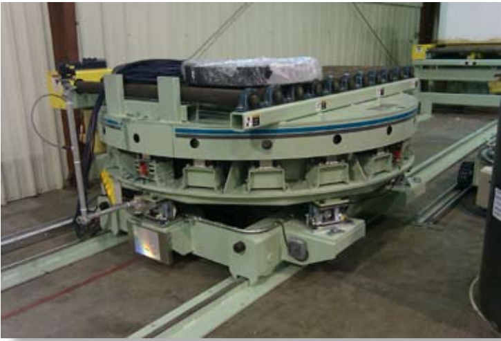
Extreme duty turntable on rail guided cart