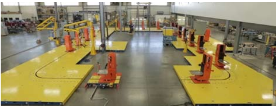
Floor Guided system for assembly of marine engines