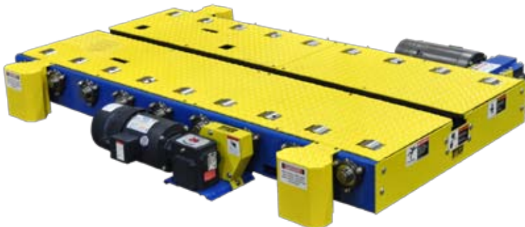
Heavy duty AGV