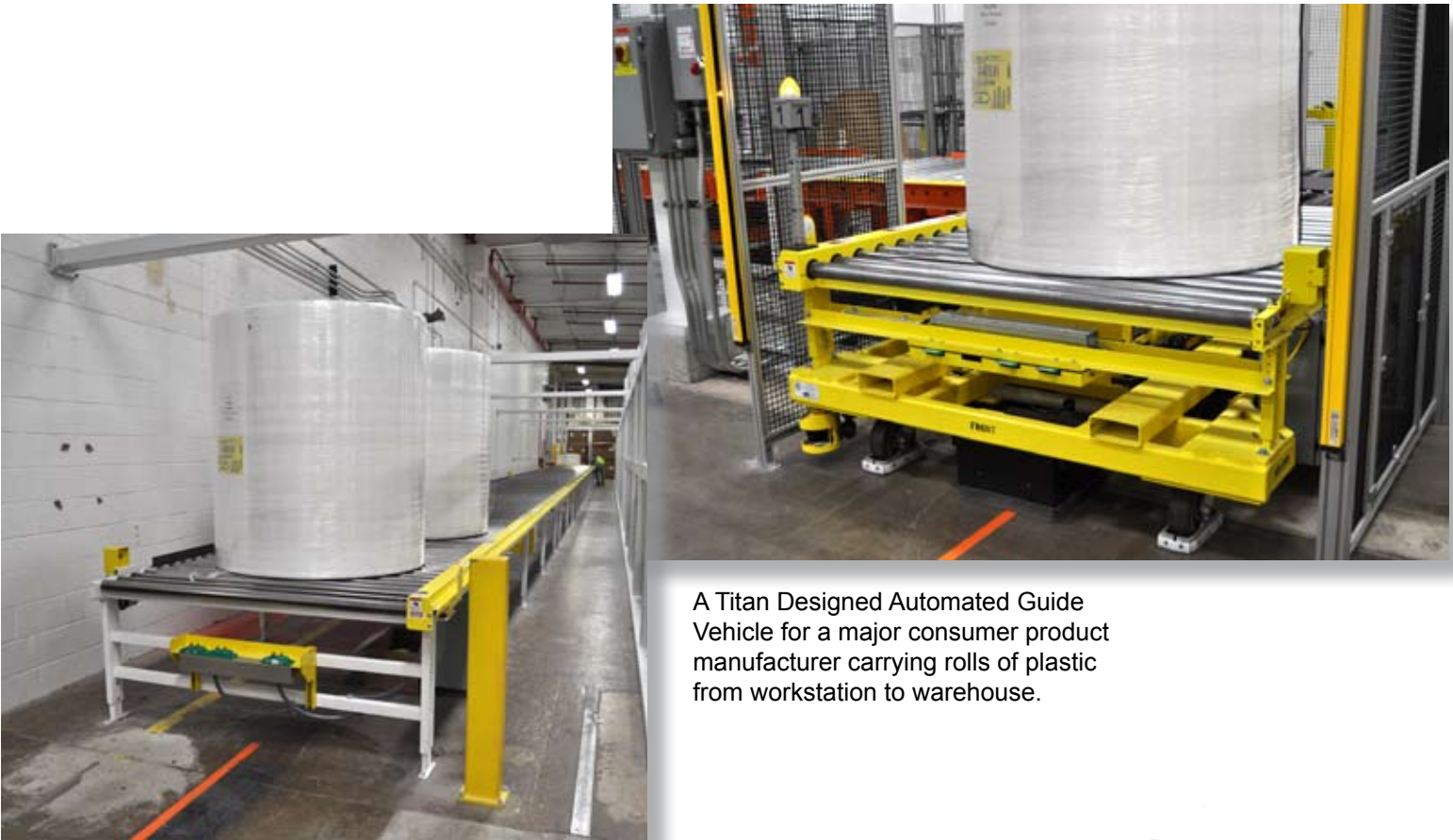
A Titan Designed Automated Guide Vehicle for a major consumer product manufacturer carrying rolls of plastic from workstation to warehouse.