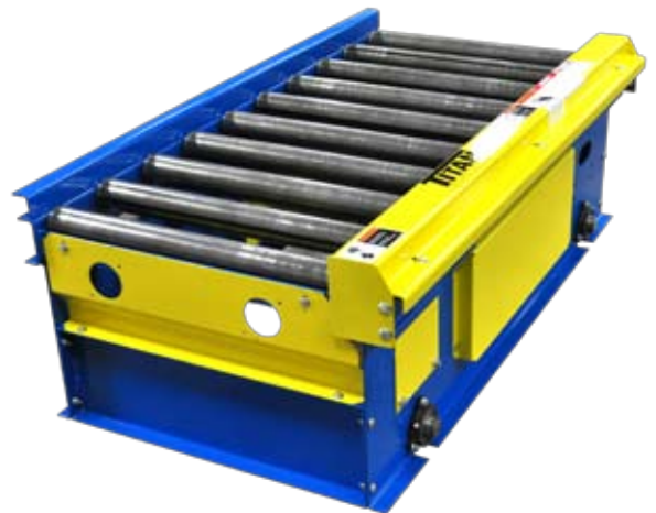
Rail Guided AGV with CDLR