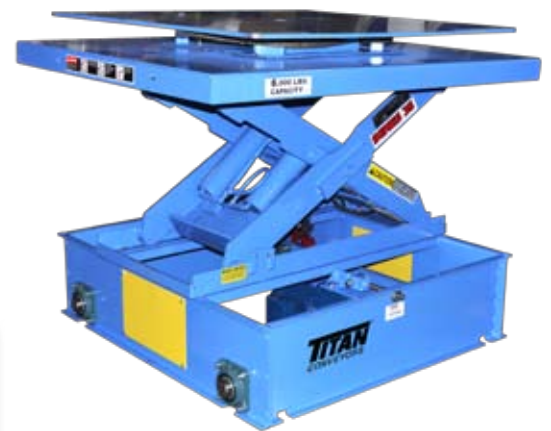
Turntable with pneumatic lift on rail guided cart

A Titan Designed Automated Guide Vehicle for a major defense contractor carrying diesel engine components from workstation to workstation.