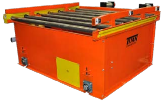
Rail Guided CDLR with product pusher & centering