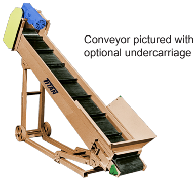
Conveyor pictured with optional undercarriage