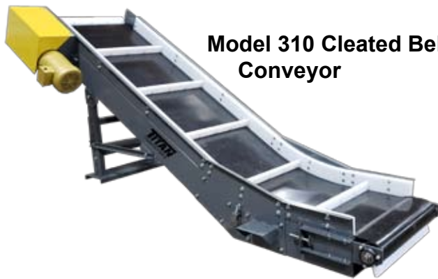
Model 310 Cleated Belt Conveyor

Titan Cleated Belt Conveyors are available in a variety of models to suit your material handling needs.