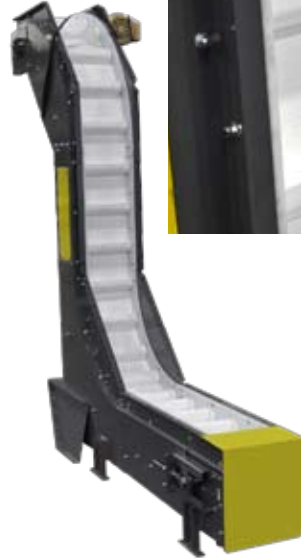
Plastic belt conveyor with scoops for small parts