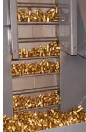
Shell Casings loaded on belt from hopper