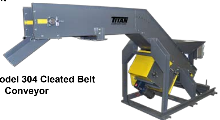
Model 304 Cleated Belt Conveyor