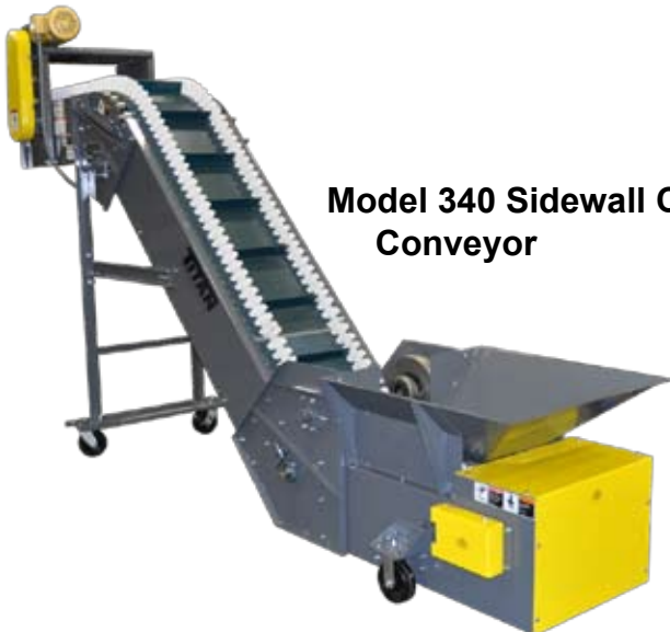
Model 340 Sidewall Cleated Belt Conveyor