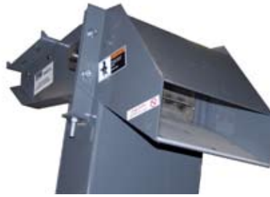
Special discharge chute