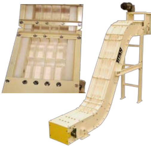
Titan designed and built plastic belt conveyor with 4 lanes for transporting colored plastic pellets to packaging