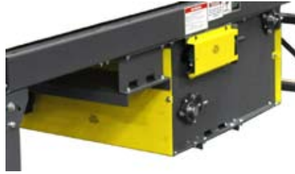
Center Mount Drive