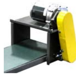
Top Mount Drive