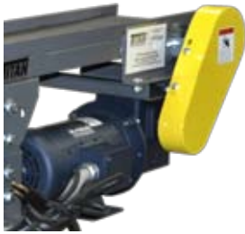
Bottom Mount Drive