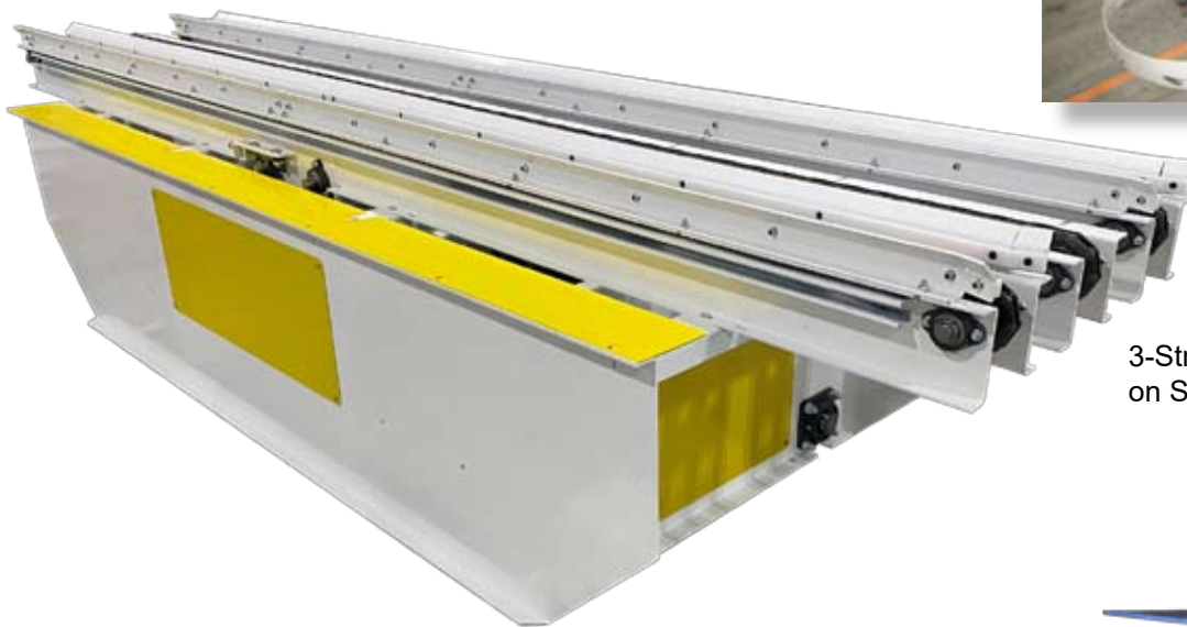
3-Strand Chain Conveyor on Shuttle Cart