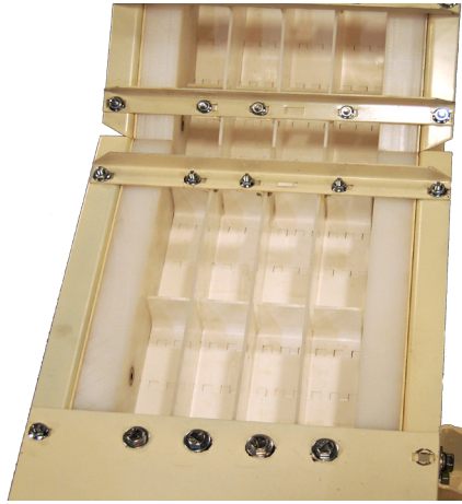
Titan designed and built plastic belt conveyor with 4 lanes for transporting colored plastic pellets to packaging