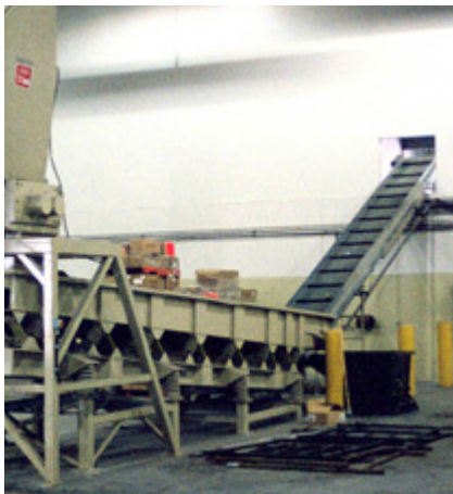
Model 340 - 460 system for delivery of bulk materials for shipping