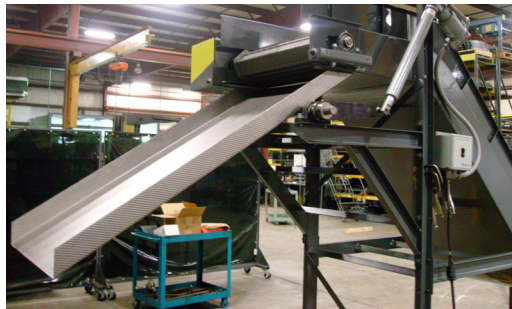
Special pneumatic chute for diverting material to specialized bins.