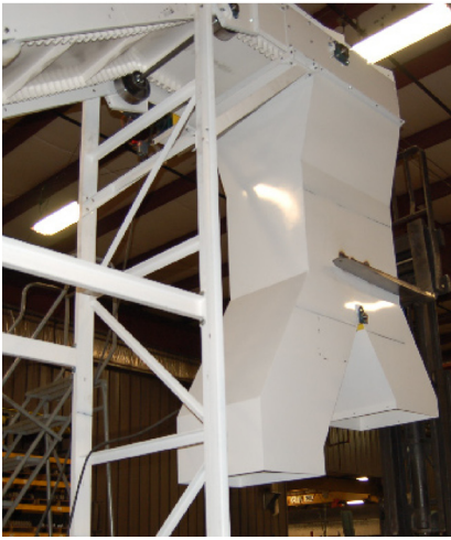
Special delivery chute for bulk material

Titan engineering will work with you to customize any standard conveyor to solve your bulk handling problems. Our innovative engineering will provide you with an economical and practical solution.