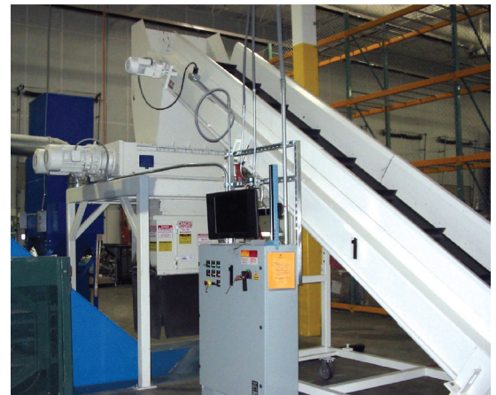
Model 340 transporting paper for shredding.